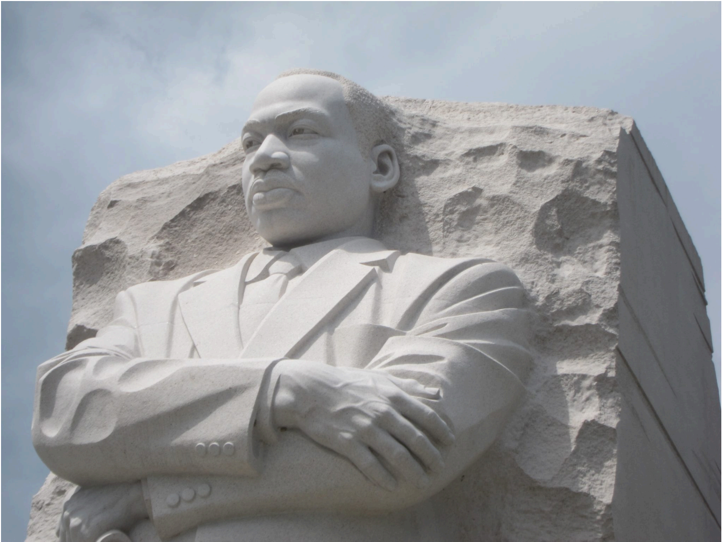
Martin Luther King, Jr. Memorial in Washington D.C.