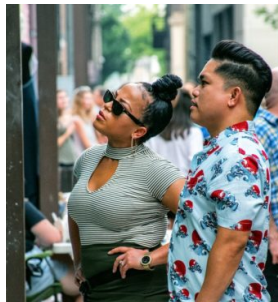
The Bible and Race