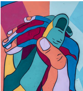
The Sin of Racism