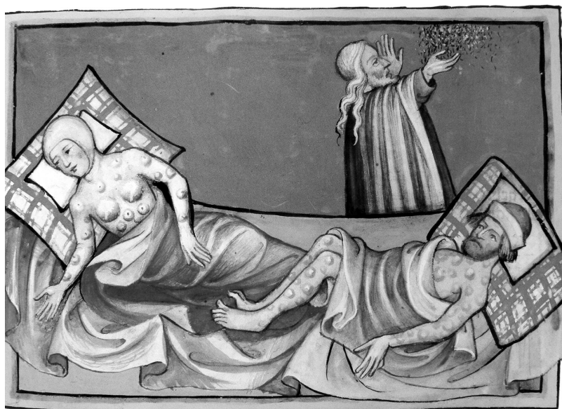
Figure 1. Victims of the Black Death. From the Toggenburg Bible, Switzerland, ca. 1411. Kupferstichkabinett, Staatliche Museen zu Berlin.

the abandoned households of some of the plague victims who had been sent to the pesthouse.