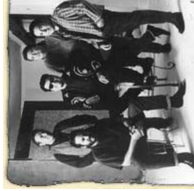
Above: City employees unite to work toward smoke-free buildings