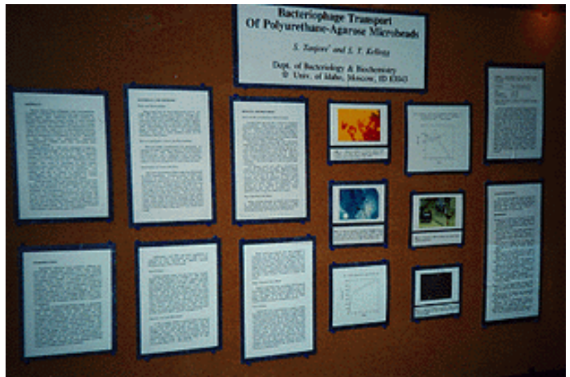
This poster provides both text and graphics. Graphics will most often draw viewers' attention first.